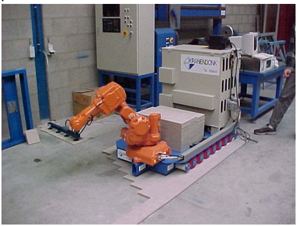
Figure 4. Tiling robot (2)