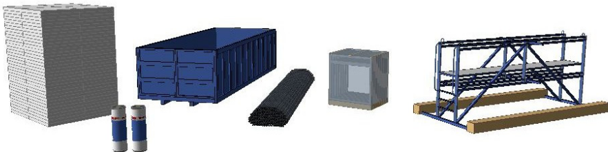
Figure 1. Examples of site planning objects created in the TurvaBIM-project.

The main objective was to create three-dimensional and identifiable site planning objects. The development work does not cover constructing object parameters, in other words objects' adaptability concerning materials, dimensions or other properties. Most of the 3D objects look real and are understandable, for example the wood saw, the trash pallet/skip, bundled reinforcing bars, window packages, and polystyrene-insulation bales. A general 3D-object was created to represent storage areas for less frequently occurring materials. When using a general object, the 3D appearance can be improved by selecting a suitable 3D surface material for the case. Examples of site planning objects created in TurvaBIM project are presented in Figure 1. Examples of safety-related objects included in the TurvaBIM library are the pedestrian shield and the precast element stud, and the safety railing found as ready-modelled. Useful ready-modelled objects were found mainly in the Construction Equipment library from Graphisoft Object Depository [1]. The standard library of the used modelling software (ArchiCAD 11) contained only single usable 3D objects for site planning, such as a truck.