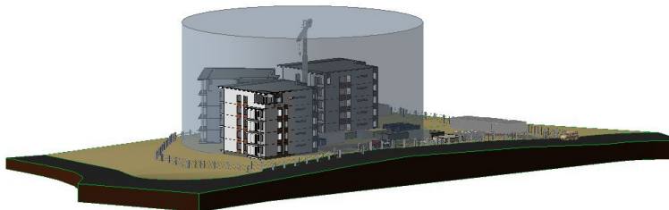
Figure 4. Figure 4. Visualization of crane reach [9].