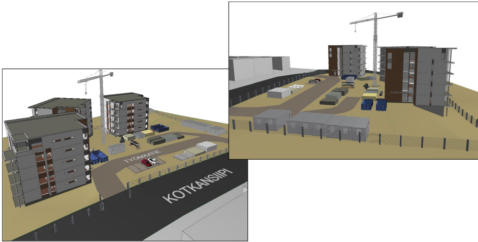
Figure 3. General views of the model based site plan created in the TurvaBIM research project.

To be able to demonstrate BIM-based planning of fall protection related to precast unit installation stage of a building project, the BIM-based site model and the structural engineer's ArchiCAD model, that included precast concrete members, were combined. Splitting the walls of the architectural model into precast units had been done using the ElementtiApi-application. Additionally, the 4D simulation test was carried out by using the same combined model, linking schedule information to the site layout objects.