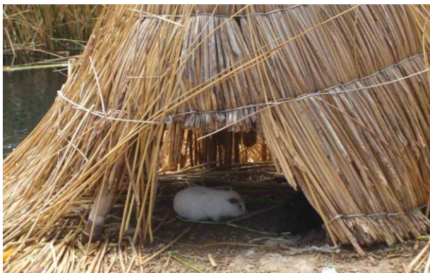
Figure 5: Guinea pigs small farm

Some islands have their own animal's farms, where they grow animals such as pigs and cuyes (guinea pigs) and some birds such as chickens and ducks.