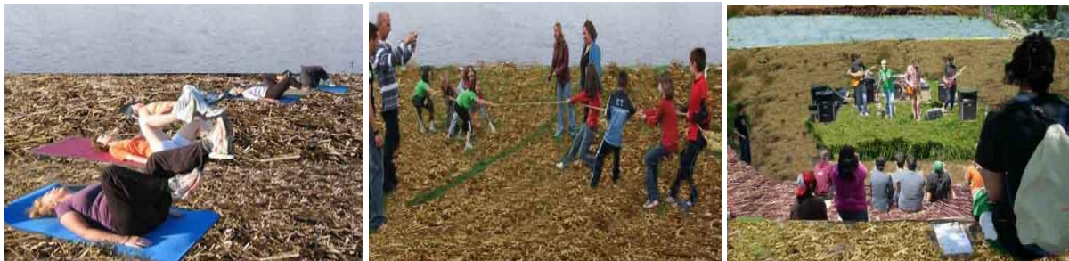
Figure 13: Art work © R. Torres

Provide a special experience for extensive recreation : Outdoor floating events: