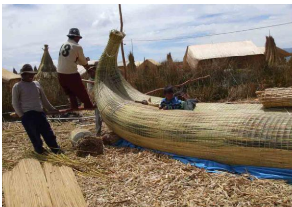
Figure 10: Technique compressing totora by hand.

Only the last layer is entirely made of totora stems.