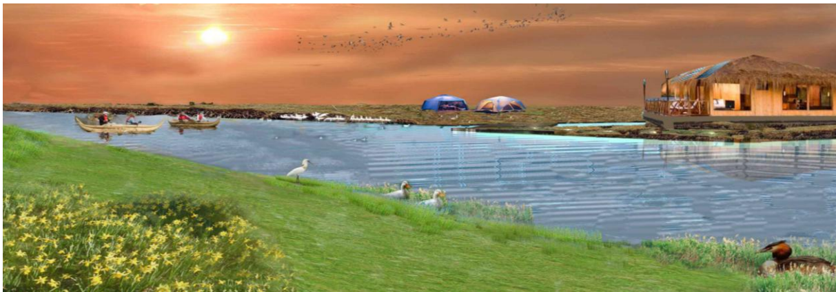
Figure 11: Art work © R. Torres

Researching floating natural reed Totora might open opportunities for new green innovative solutions in diverse contemporary uses: