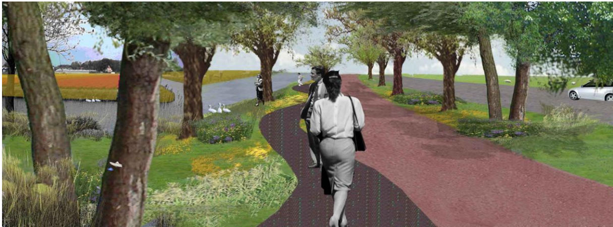
Figure 12: Art work © R. Torres