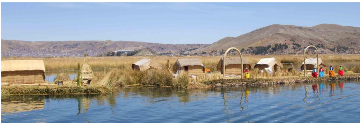
Figure 3: Uros hand made reed floating island

The purpose of the island settlements was originally defensive. The Uros mention that it was safer to live on the water in order to avoid invaders: first the Incas and later on the Spanish invaders.