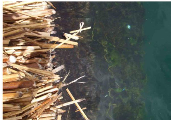
Top view of an island edge (1.5 -2m. deep)