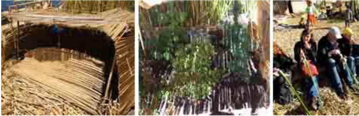
Figure 6: Small greenhouses