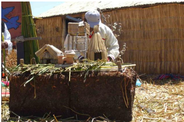
Figure 9: Construction process maquete

With appropriate maintenance the islands can last up till thirty years.