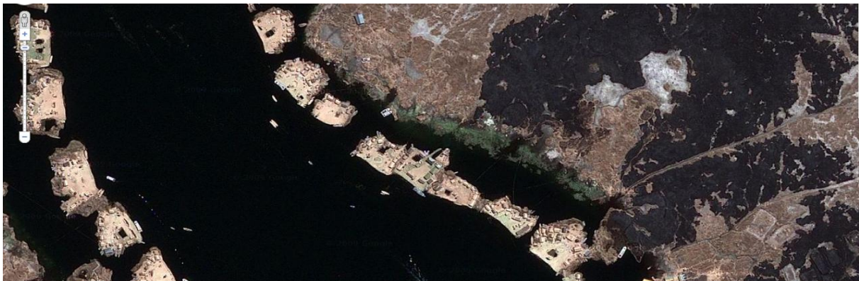
Figure 2: Totor islands, next to each other on Titicaca Lake.

Currently they speak Quechua and Aymara dialects. The majority also speaks Spanish, which is the official language in Peru.