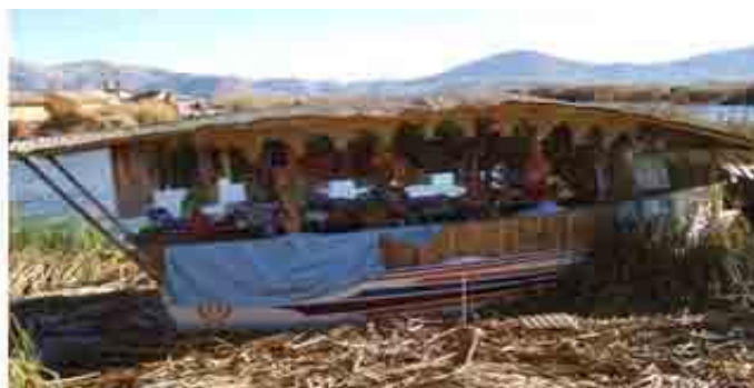
Figure 8: Girls going to school