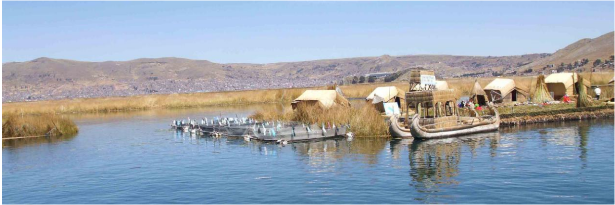
Figure 4: Fish farm, Uros set the nets during the afternoon and fish is collected the next morning.

The Uros fish carachi and trout . They also cultivate fish farms, for their own consumption and for offering them to the tourists in the floating restaurants.