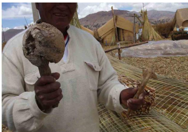
Tree roots as building tools