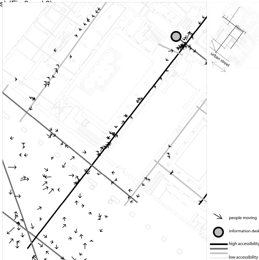
Figure: 3 Santa Maria Nuova Hospital: on the right top the accessibility map of the hole hospital, on the left a zoom on the access to the hospital from the urban street

We propose here a comparison among hospital entrance of Santa Maria Nuova and Careggi which allow us to observe the critical point in access to hospital for a patient. We can note in the maps: the layout analysis (axial lines in greyscale), the location of information point (circles), the concentration of meaningful groups of social relations, the users desire line (arrows)