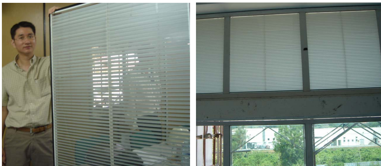
Figure 4 : CK Tang with prototype daylight window, left. Installed window right.