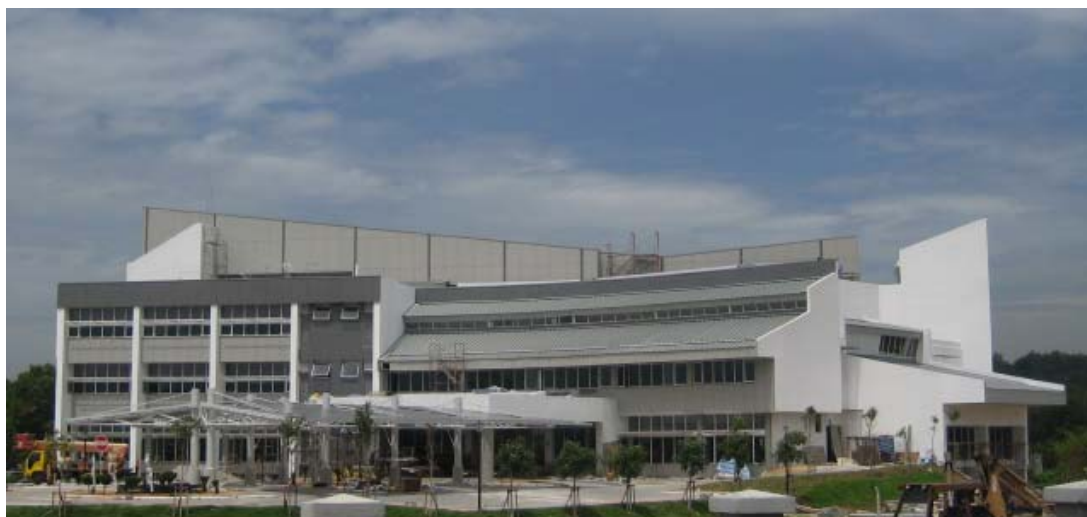
Figure 1. The PTM ZEO Building

The new Zero Energy Office Building ( ZEO Building ) is presently being finalised, and the client, Pusat Tenaga Malaysia, PTM ( Malaysian Energy Centre ) will move into the building in May 2007. In line with the scope for Pusat Tenaga Malaysia being the research arm of the Ministry of Energy, the new building will itself be a research and demonstration building for new energy technologies in buildings in Malaysia. The new PTM building aims to demonstrate that an office building need not consume any electricity produced from fossil fuels. All electricity needed to run the building is produced by the buildings own Photo-Voltaic System ( PV System).