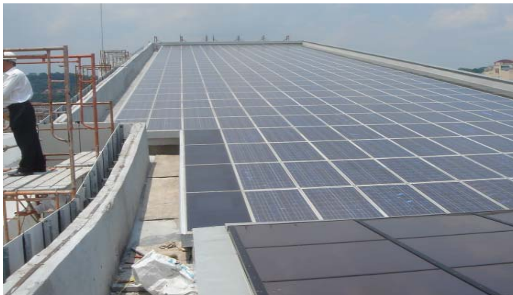
Figure 3 : The larger PV roof, 45 kWp polycrystalline, in the foreground : part of thin film 6 kWp

The BIPV system of the new PTM ZEO building is a National Demonstration projects for BIPV under the Malaysian BIPV program. This program is funded by the United Nations Development Program, the Global Environmental Facility, the Government of Malaysia and PV companies in cooperation.