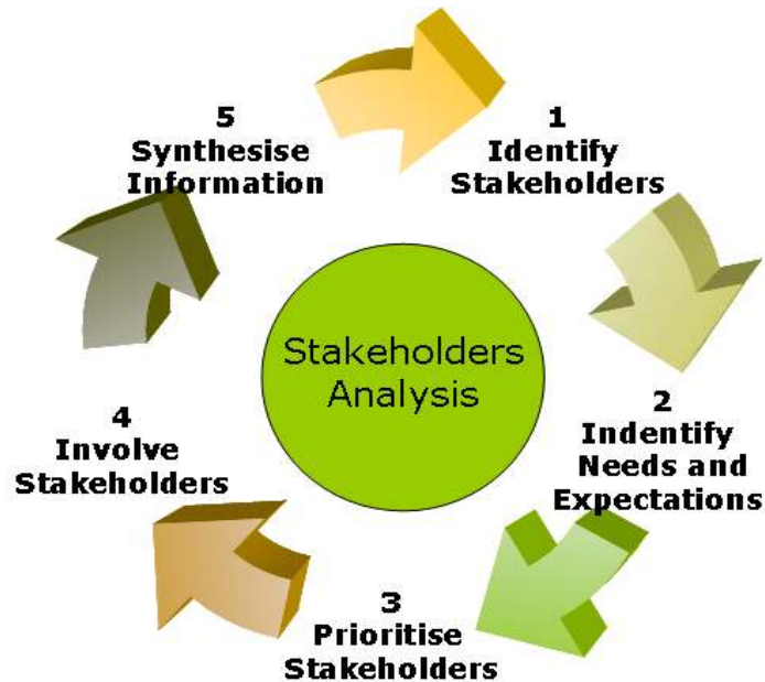
Figure 1: Stakeholder Methodology