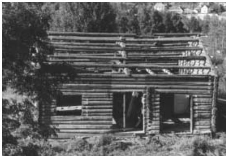
Figure 4 Disassembly of log house in Norway

the most ambitious plan for including design for deconstruction in planning. They established the “Building System for Reuse” or BfO system which decouples building systems, eliminates the uses of composites, and relies on traditional, locally produced building materials and well-known simple technology. The BfO system includes 88 standard wood and concrete components that can be assembled into a wide variety of configurations. The ability to easily assemble and dismantle the components also allows the capability of easily changing or reconfiguring the building to meet the user’s needs over time. A follow on project that takes advantage of the BfO system is called ADISA or Assemble for DIS-Assembly and consists of 45 standardized components with space planning based on a module of 600 mm. Presently a pilot project at the Prestheia eco-village is building 19 dwellings using the ADISA system (Myhre, 2000).