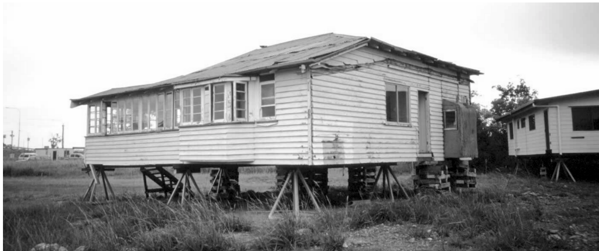
Figure 2 Relocation of typical residential structure near Melbourne, Australia (Philip Crowther)

The total waste stream in Australia is about 14 million tonnes of which somewhere between 14% and 40% is C&D waste. Deconstruction of 70 to 100 year old timber houses in Australia is a common practice with about 80% of the materials being recovered and reused for renovation and remodelling of existing homes or in the construction of new, replica housing. Additionally the relocation of houses is a common practice, with 1,000 homes being moved in the Melbourne area each year out of a total housing stock of 800,000 units (See Figure 2). For residential structures it is estimated that between 50% and 80% of materials are recovered in the demolition process. The recovery of materials from commercial buildings is significantly lower with a total recovery rate of about 69% (58% reuse and 11% recycled). In Australia up to 80% of concrete is processed to recover the aggregates for reuse in construction. For modern housing, the emergence of new systems of prefabricated buildings allows the potential deconstruction of the housing stock in the future. EcoRecycle Victoria provides guidance for waste minimization in construction and demolition including Tender Guidelines for Construction and Demolition Projects and includes the consideration of deconstruction as an element of the tendering process (Crowther, 2000).