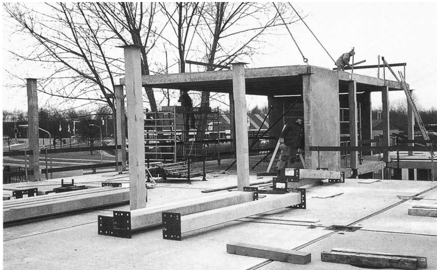
Figure 3 The MXB-5 demountable precast concrete system with dry-mounting method

the most ambitious plan for including design for deconstruction in planning. They established the “Building System for Reuse” or BfO system which decouples building systems, eliminates the uses of composites, and relies on traditional, locally produced building materials and well-known simple technology. The BfO system includes 88 standard wood and concrete components that can be assembled into a wide variety of configurations. The ability to easily assemble and dismantle the components also allows the capability of easily changing or reconfiguring the building to meet the user’s needs over time. A follow on project that takes advantage of the BfO system is called ADISA or Assemble for DIS-Assembly and consists of 45 standardized components with space planning based on a module of 600 mm. Presently a pilot project at the Prestheia eco-village is building 19 dwellings using the ADISA system (Myhre, 2000).