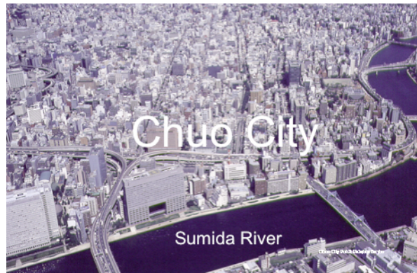
Figure 1 High-Density Buildings in Chuo City, Tokyo

We believe that if our urban design encourages more people to live in the greater Tokyo central area, and to enjoy efficient urban lives, we will be on the right track for solutions to such problems as energy conservation and waste disposal, which are critical to the global environment.