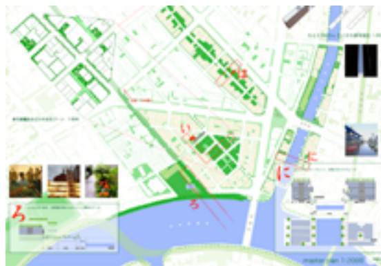
Figure 3 Images of re-design for urban archtype in Nihonbashi Area no.4

We propose that Chuo City will incorporate new types of buildings which will be developed through the fusion of light structure and infrastructure. While more high-rise apartment buildings will be constructed, medium-rise buildings will be redeveloped through conversion and connection. Buildings will be more intelligently networked and energy wastage in the city will be reduced. We propose to upgrade the functions and capabilities of the city to become more compact and intelligent. Once the quality of living spaces is improved, efficiency of material and energy use will be greatly enhanced. We will develop new types of buildings and urban spaces that meet different lifestyles, and make full use of IT. Apartment and condominium complexes combined with 'floating' city and highway systems will be developed.