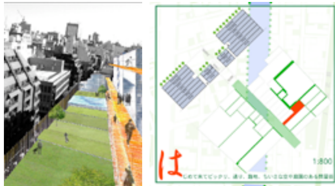
Figure 4 example of studied archetype for urban dwellings

We envision the entire ward being an intelligent light city by the technologies of Traffic, Logistics / Intelligent Energy, Optimization / Fuel Cell / On-demand Water Purification through changes in lifestyles.