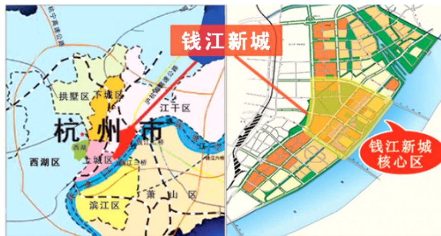
Fig.1 the location of Qian Jiang Xin Cheng (Hangzhou new CBD)

The new City Plan puts forward the developmental strategy that “enlarge city eastward, develop tour industry westward, explore along the river and develop over the river”(Hangzhou city general plan outline, 2002), and it also brings forward a new developing way and specifies new developing structure. According to this developing idea, Hangzhou will transform the old layout that seems old city as corn area into a cross-river, along-river and network layout that take the Qiantang River as the axes. In addition, from the aspect of Hangzhou’s future industry structures, the best area for Hangzhou CBD is the area that between Qianjiang Second Bridge and Third Bridge. Thus, it will quicken the pace of building new city, stimulate the development of along-river area, transfer people to east and south area, boost city’s exploration, promote the city evolve to multi-center, and finally realize interaction of “reserve the old city, build the new city”, so as to harmonize the relationship of modern metropolis and historical city. Therefore, the predominant location of Hangzhou CBD (Qian Jiang Xin Cheng) is most hopeful to be the CBD in Hangzhou in near future.