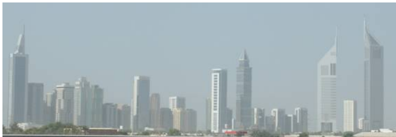
Figure 4: The modern urban centre of Dubai (Sheikh Zayed Street).

The modern process was established in Dubai during the second half of the 19th century, with fast urban development following the discovery of oil. Therefore, the demand for occidental buildings and western planning ideologies increased. In 1954, a British firm was commissioned to improve port facilities and deepen the creek entrance. Few years later, a new municipal council was established and dominated mainly by foreigners. One of the most important roles of the municipality was the active participation of establishing the Dubai Town Planning Scheme, which was carried out in 1971. This plan had an impact on the growth of the city and especially the provision of an efficient network linking both sides of the creek through constructing Al-Maktoum and Garhoud bridges as