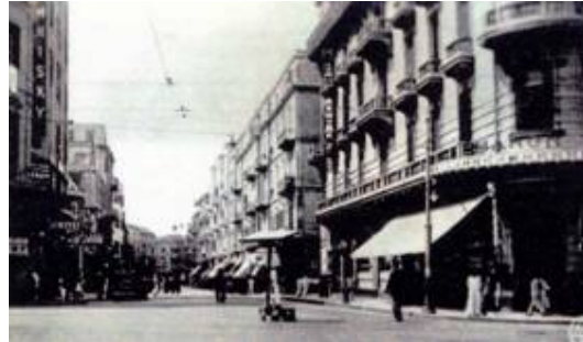
Saad Zaghloul street, Alexandria, Egypt