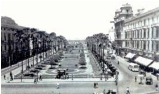
The French square, Alexandria, Egypt