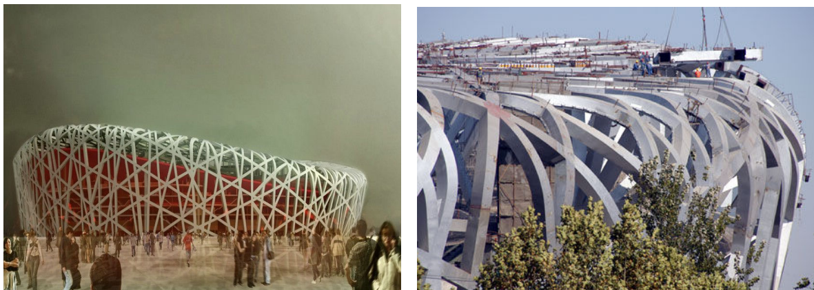
Figure 1. the construction of National Stadium

In the new design, the roof of the stadium had been omitted from the design. Experts say that this will make the stadium safer, whilst reducing construction costs. The construction of the Olympic buildings will continue once again in the beginning of 2005. The stadium's appearance is one of synergy, with no distinction made between the facade and the superstructure. The structural elements mutually support each other and converge into a grid-like formation - almost like a bird's nest with its interwoven twigs. The spatial effect of the stadium is novel and radical, yet simple and of an almost archaic immediacy, thus creating a unique historical landmark for the Olympics of 2008. The stadium was conceived as a large collective vessel, which makes a distinctive and unmistakable impression both from a distance and when seen from up close. It meets all the functional and technical requirements of an Olympic National Stadium, but without communicating the insistent sameness of technocratic architecture dominated by large spans and digital screens.