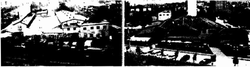
Figure.6. The Market Hall Building before and after its restoration

Conversion of the Market Hall Building to Cultural Centre: The market hall of the city moved from the city centre to a more accessible location on a suburban industrial area and the old building of the market hall left to deteriorate. The physical structure of the old building was conserved and rehabilitated so as to give spatial opportunity for new uses. With the dynamic leadership of the municipality, the building and its surroundings were converted to a cultural centre named “The Market Hall Youth Centre” (Haller Gençlik Merkezi). This cultural centre includes, a public theatre, a theatre for children, an ice rink and many commercial and entertainment units and restaurants. The case of “The Market Hall Youth Centre” can be represented as a flagship Project acting as a magnet for further developments. Locating on the transport axis of the university and the city centre, it provides a suitable physical and social environment attracting the young people and the residents (See Fig. 6).