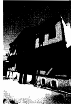
Figure. 5. The Headquarter Building before and after its restoration

Conversion of the old Slaughterhouse to a Complex for Restaurants: The old slaughterhouse had been vacant for about three years and the Municipality decided to convert it to a complex for restaurants serving different kinds of meals after the rehabilitation studies. This complex is an alternative entertainment place for the inhabitants of the city with wide green areas surrounding.