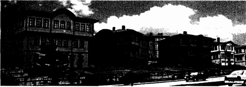
Figure. 4 Traditional Houses in Odunpazarı after restoration studies

Conservation and Redevelopment of Odunpazarı Traditional Area: The traditional houses in the “Odunpazarı”, the first settlement area of Eskişehir were renovated and restored. These houses were converted to either cultural buildings like museum, library, children theatre, or touristic buildings like guest houses and restaurants. This project is the Pioneer one for cultural heritage conservation studies in the city (See Fig. 4). Restoration of the building which served as a headquarter during the Turkish War of Independence, and its new usage as a museum has a special value for conservation and transmission of historical heritage (See Fig. 5).