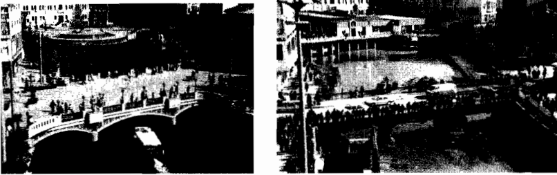
Figure.2. The River Porsuk before and after the rehabilitation studies ( www.eskisehir-bld.gov.tr )

Rehabilitation and Sanization of the River Porsuk: After 1960s urban and industrial waste caused pollution of the river so that it was declared as one of the dirtiest rivers of Europe in 2002. What's more it was a great threat for its near environment for water flood. The Metropolitan Municipality of Eskişehir undertook the rehabilitation and sanization studies of the river together with the studies to strengthen the bridges over the river against natural disasters. On the other hand, 24 new bridges were built and arrangements about waterborne traffic were made in order to improve the transportation possibilities of the city (See Fig. 2)