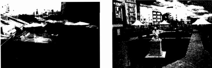
Figure.3. The Dip Bazaar before and after the rehabilitation studies

Rehabilitation of Dip Bazaar(Çukur Çarşısı): A small natural island in the middle of the river Porsuk which had been used as a fish market for lots of years was converted to an urban park with playgrounds for children, cycle and walking paths and a big amount of green space (See Fig. 3)