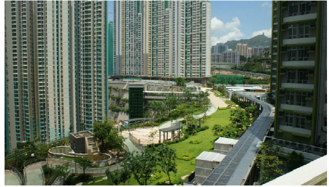
Fig.5 Conserve a community park

Much thought was given to enhance the quality of a healthy living; therefore, the elongated site was designed to create a leisure walk trail, integrated with gentle-gradient ramp for barrier-free access and steps for fast circulation. The 30 m level difference of the site was overcome by a system of ramps and a steel bridge, integrated with short steps for fast moving to facilitate different park users.