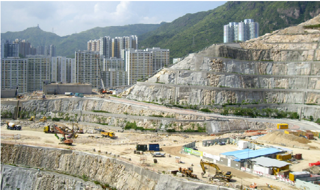
Fig.4 Ex-quarry site

The design concept was to blend in the open spaces with surrounding public housing estates and to reinstate the environmental quality of ex-quarry site.