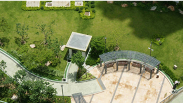
Fig.8 Tai-chi area with rain/sun shelter