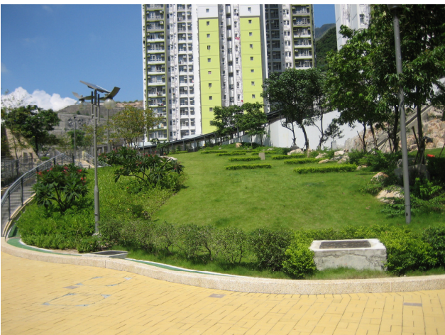
Fig.10 Trees, shrubs and lawn by turf

Large-scale planting of trees and shrubs was carried out along the peripheries of the open spaces for both aesthetic and design purpose. Due to the hostile nature of the quarry site, special plantings techniques had to be used by the project team to overcome the site constraints and to ensure a sustainable long-term landscape maintenance programme.