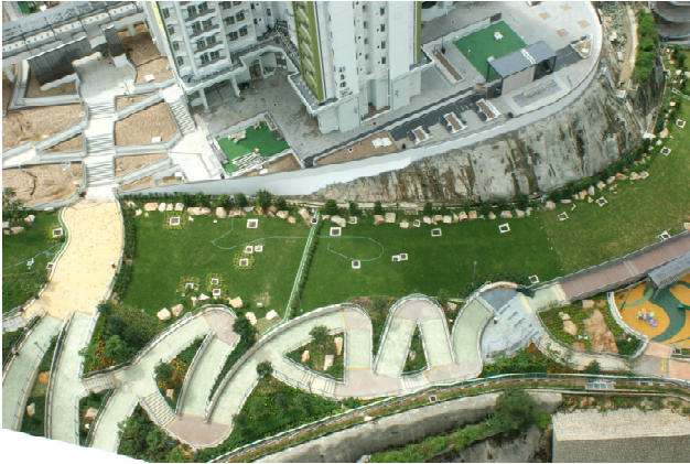
Fig.14 Gentle gradient ramp integrated with steps