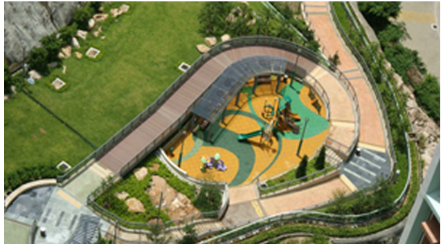
Fig.9 Children's play-area

Exercise areas serve as places for social gathering as well as for morning exercise. Public toilets and sheltered seating were positioned at convenient areas for park users. The theme of granite geology was adopted to make use of the natural conservation for educational purpose.