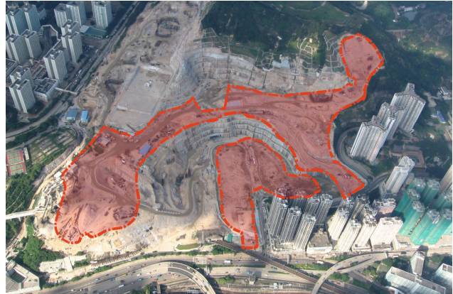
Fig.2 Choi Wan Road District after excavation

The Choi Wan Road Development had involved extensive site formation work that had transformed large extent of the natural hillside and abandoned quarries into building platforms for public housing, schools, and recreational developments.