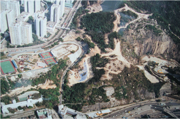
Fig.1 Choi Wan Road District before excavation