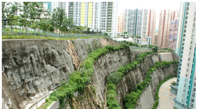
Fig.11 Slope greening