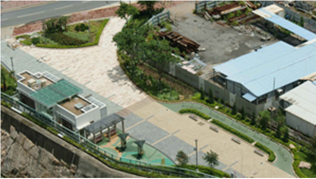
Fig.6 Public toilet and Elderly fitness area