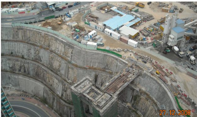
Fig.12 Steep and elongated site

Steep and elongated site , the rocky sloping site had a total site area of 1.36Ha, with a distance of of 270m from the upper platform to the lower platform, and the northern part of the slope is occupied by a 6.0m wide drainage reserve. The 32m level difference between upper and lower platforms had limited the freedom of design and the provision of certain recreation facilities. The site had to be designed as a meandering walking trail no steeper than 1:12 with selected facilities along it. Level changes are minimized in order not to disturb the existing manholes in the drainage reserve previously constructed before the site formation stage. The final design had made use of the meandering path to create viewing stations and platforms for various uses and activities.