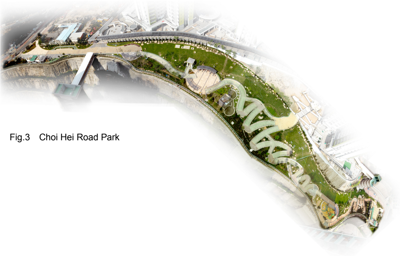
Fig.3 Choi Hei Road Park

Choi Hei Road Park is located on a sloping platform between public housing developments with an elongated slope and an overall level difference of 30 m. The northern part of the site was occupied by a 6 m wide drainage reserve for the entire Choi Wan Road development sites.