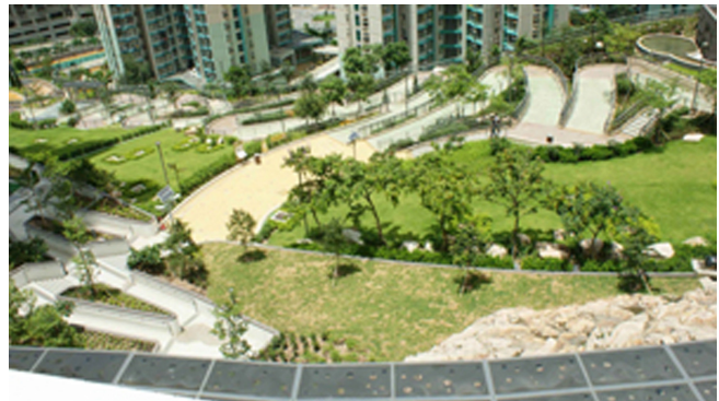
Fig.13 Meandering walking trail (gradient 1:12)

Planting in an ex-quarry site , is another challenge. After site formation, the DOS site was largely barren with no vegetation and there was a lack of topsoil layer. The design team had included contract specifications requiring the Contractor to remove top 900mm existing bedrock and debris for those pre-design tree planting locations, backfilled with decomposed granite and soil conditioners for later-stage planting works. This measure enabled the project team to carry out large tree planting for screening and amenity tree plantings at strategic locations. Localized soil mounds were all created for massive tree and shrub plantings for a series of spatial effect to the sloping site.