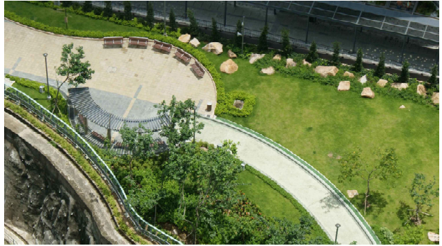
Fig.7 Sitting out area