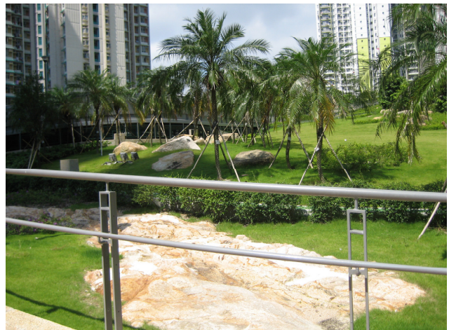
Fig.16 Natural granite outcrops shows for educational purpose

Conservation of existing natural granite. Early before the commencement of the construction of Choi Hei Road Park, a land survey was conducted to locate the existing natural granite outcrops, which was part of the heritage of the ex-quarry site. NGOs and local interest groups also offered assistance to identify the history and illustrations of the granite geology for display within the park. The local 'Association for Geoconservation' had given their expertise and advice during the design and construction stage for the display of the geological development and display of rocks within the park, and had contributed much to the education aspect of the site.