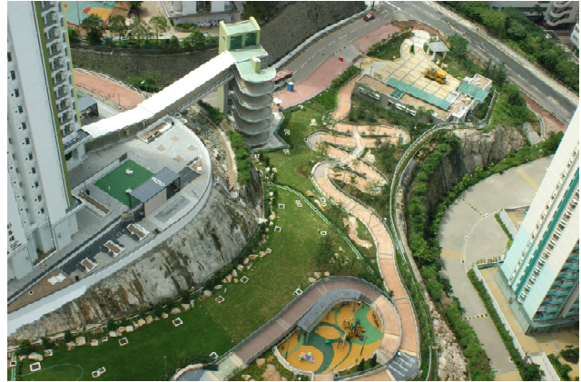
Fig.15 Leisure walk trail (gradient 1:12)

Extensive tree transplant was carried out in Jan 2010, 91 nos. mature trees including Hibiscus tiliaceus , Lagerstroemia speciosa , and Crateva religiosa from another district (Kwun Tong) were brought in from Sports Ground and Swimming Pool which was undergoing re-development. The large-scale tree transplant required good co-ordinations and planning among various parties and contractors. The transplanting works were well executed by the project team and helps to create some 'immediate greening effect' for the ex-quarry site.