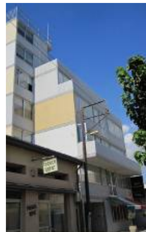
Fig. 3. Dorothea Building

DOROTHEA building (Figure 3) (offices and laboratories of the Mechanical Engineering and Geomatics labs of the Civil Engineering Department): This building was built in 1980 and originally used for warehouses. The total building area is 2,300 m 2 , over 5 floors. It is currently rented from the owner on a 20 year lease. The total renovation cost is 2 million euros, with 1 million being paid by the owner and 1 million being paid by the Cyprus University of Technology. The basement has 300 m 2 of useable space for the instrument storage of the Mechanical Engineering Department. The ground floor has 133m 2 of useable space and the first floor has 245m 2 useable space for the labs and offices of the Mechanical Engineering Department. The second floor has 263m 2 of useable space and the third floor has 264m 2 of useable space allocated to the labs, offices and storage of the Civil Engineering Department. The fourth floor, with 184m 2 of useable space and the fifth floor with 165m 2 of useable space are allocated to the labs, offices and stores of the Mechanical Engineering Department.