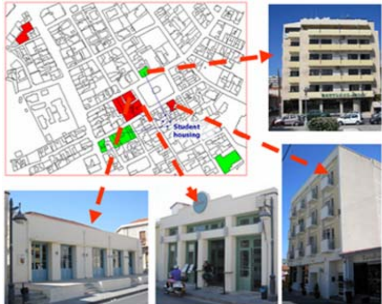
Fig. 5. Hero's Square

This area of Limassol was the “red light district” and was considered an undesirable part of the city, due to the high number of brothels, cabarets, gambling shops and low quality buildings. Currently, several of the buildings have been renovated. The Roussos Plaza and Zappeio buildings are two of the buildings in Hero's Square that have been renovated. The Roussos building contains the Laboratory of the Applied Arts and Communication Department, complete with multimedia workstations, classrooms, photography labs on the ground floor, in a total space of 301m 2 . The first floor of the Roussos building contains the research space, offices, meeting rooms and stores of the Laboratory of the Applied Arts and Communication Department within 176m 2 . The second floor of the building has a space of 208m 2 and the third floor has a space of 192m 2 , which are student accommodations complete with kitchen, toilet and shower. The Zappeio building is the student café, which is a social gathering place complete with student bar and café. It has 128m 2 of useable space on the ground floor and 10 m 2 useable space on the first floor. The total cost of renovation in this area is 3 million euros.