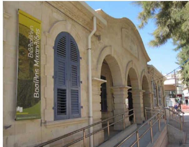
Fig. 2 Library

DOROTHEA building (Figure 3) (offices and laboratories of the Mechanical Engineering and Geomatics labs of the Civil Engineering Department): This building was built in 1980 and originally used for warehouses. The total building area is 2,300 m 2 , over 5 floors. It is currently rented from the owner on a 20 year lease. The total renovation cost is 2 million euros, with 1 million being paid by the owner and 1 million being paid by the Cyprus University of Technology. The basement has 300 m 2 of useable space for the instrument storage of the Mechanical Engineering Department. The ground floor has 133m 2 of useable space and the first floor has 245m 2 useable space for the labs and offices of the Mechanical Engineering Department. The second floor has 263m 2 of useable space and the third floor has 264m 2 of useable space allocated to the labs, offices and storage of the Civil Engineering Department. The fourth floor, with 184m 2 of useable space and the fifth floor with 165m 2 of useable space are allocated to the labs, offices and stores of the Mechanical Engineering Department.