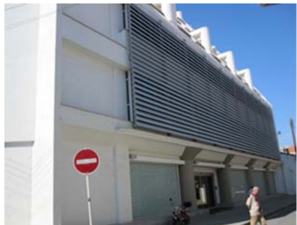
Fig. 4. Ttofi Kyriacou Building

TTOFIS KYRIACOU building (Figure 4) (offices for the Electrical Engineering department): This building was built in 1980 and originally used as a department store. It was acquired by the Cyprus University of Technology through expropriation by the Government of Cyprus. It has a building area of 3,500 m 2 , renovated at the cost of 6 million euros. The basement, of 283m 2 is the data center for the entire university. The ground floor houses the electrical and PC room, with a useable area of 208m 2 . The first floor, with a useable area of 284m 2 and the second floor with 285m 2 both house the labs and stores of the Electrical Engineering and Information Technology Department. The third floor has usable space of 258m 2 and houses the labs and stores of the Physics and Chemistry Department.