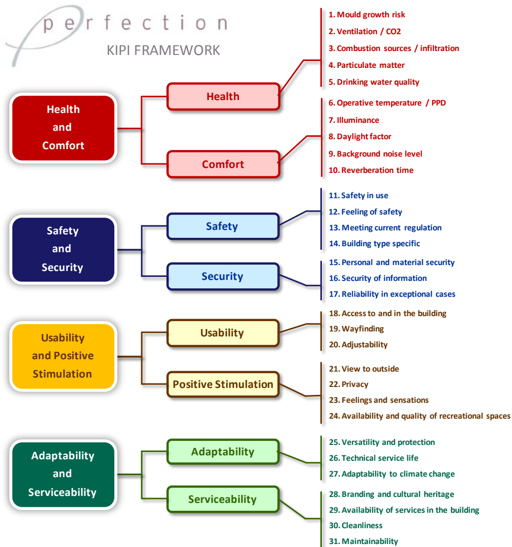
Figure 2. Improved KIPI-framework.