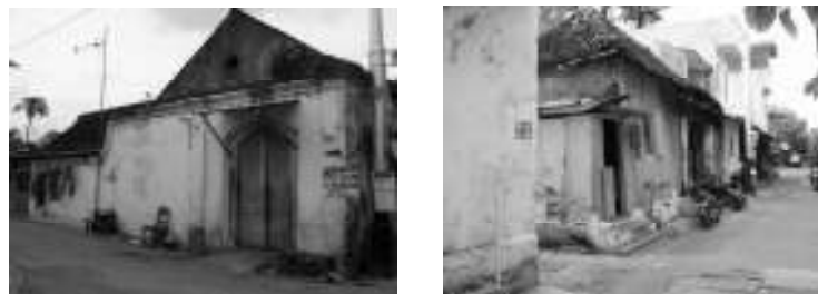
Figure 4. Ex-houses of batik entrepreneur are sleazy and damage