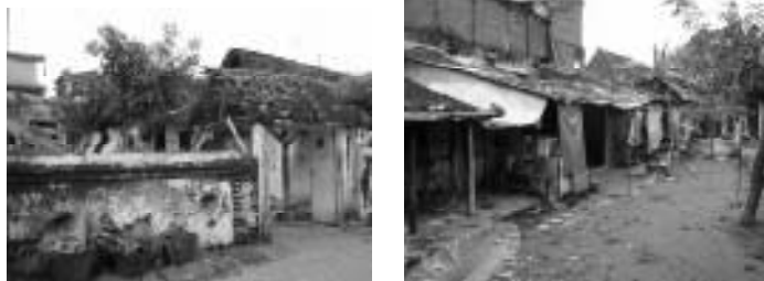
Figure 3. Ex-houses of religius serve of Keraton ( abdi dalem ulama kraton ) are sleazy and damage