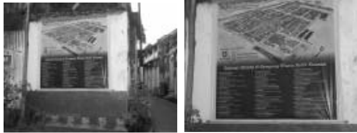
Figure 10. Heritage information on the wall wayside

Growth in physical so far is not signifikan yet, but optimism, Kauman can improve with sustainability to be a good tourism area, considering motivation of society enableness emerge from the rising generation circle.