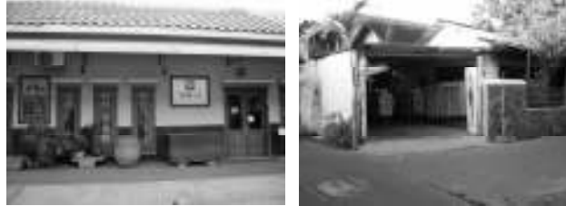
Figure 8. The new batik showroom in Kauman