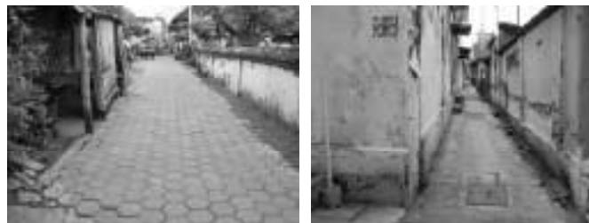
Figure 6. Street and alley without drainer network