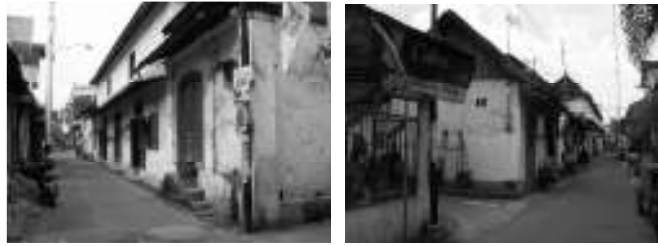
Figure 5. Crowded and full ancient building