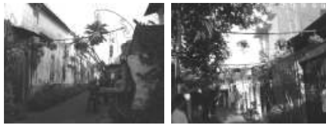
Figure 9. String hang of garden above street