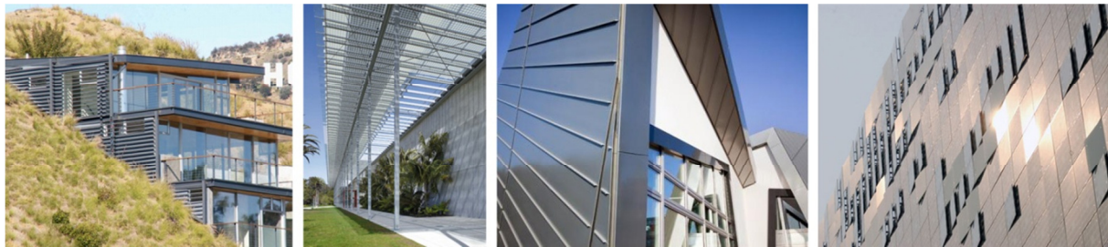
Figure 1: Views of integrated systems in 4 newly constructed buildings [Available online from www.bio-architecture.net , www.fondazionerenzopiano.org , www.jetsongreen.com , www.archdaily.com (accessed 25 May 2014)]

In this case, building integrated solar thermal systems and photovoltaics are fully integrated into the shell and form an integral part of the building design concept (Figure 1).