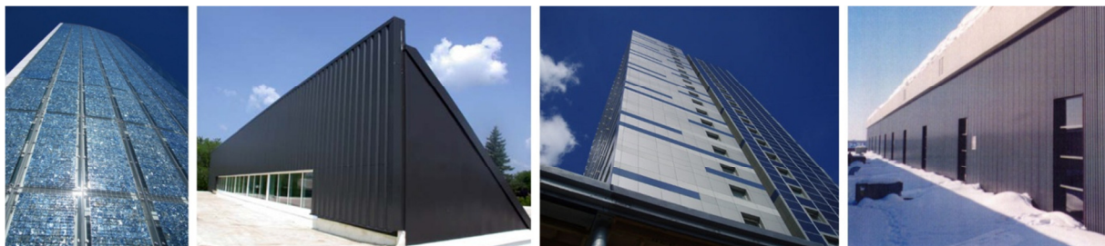
Figure 2: Views of integrated systems of 4 renovated buildings [Available online from www.projects.pilkington.com , www.solarwall.com , www.ecda.co.uk (accessed 25 May 2014)]

Similarly, there are examples of applications in renovated buildings which form part of the building envelope, while improving the building's energy performance (Figure 2).