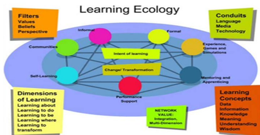
Diagram 1: Connectivism: Process of creating network (García, 2008)

The Diagram-1 generated by García (2008) shows the Connectivist view of learning as a network creation process that impacts the way learning is designed and developed. Diagram-1 emphasis the central principle of Connectivism which is the creations with usual nodes (element connected to any vertices, elements, or entities) supports and strengthens existing large effort activities. The integration of learning, knowledge and understanding through the personal extension of a personal network is the key of Connectivism.